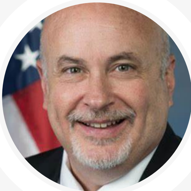
US CONGRESSMAN MARK POCAN IUPAT DC7 MEMBER